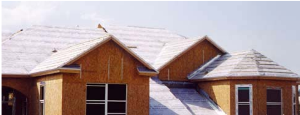
Figure C-2 Full Deck coverage = SWB